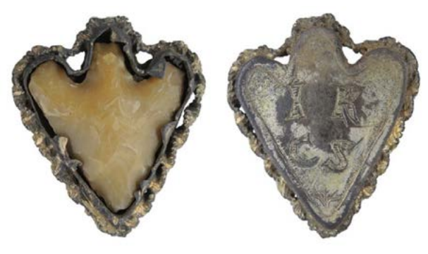
Pendant made from a Bronze Age barbed arrowhead mounted in a silver gilt decorative bezel cup. Allocated to Elgin Museum